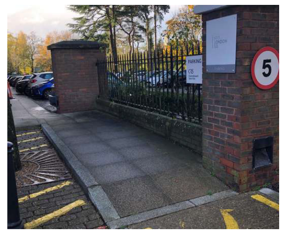
Pathways with dropped kerbs are accessible from the parking spaces, pathways are marked out by yellow lines and pedestrian graphics.