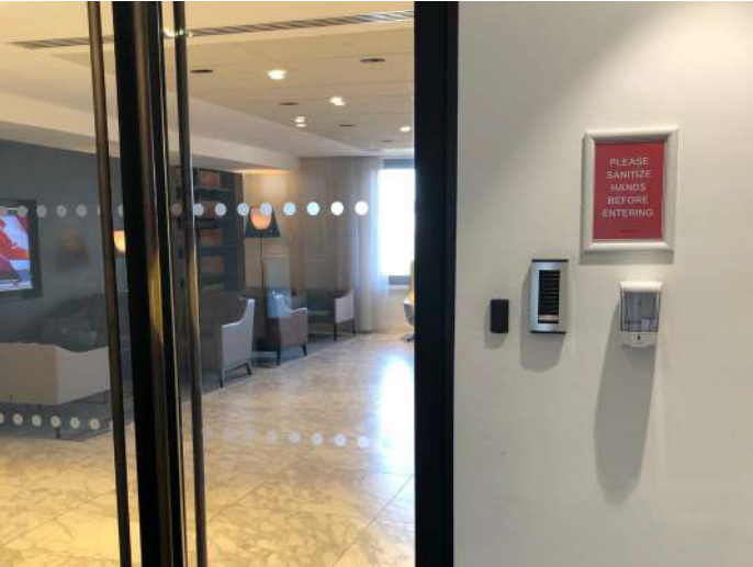
CRS Reception is on the 2nd floor, please use the inter-comm to advise the Reception Team if you require assistance to enter the reception area.