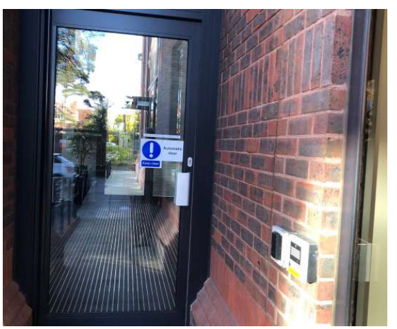
The main entrance is via a ramp, leading to an access-controlled entrance. If you have not been issued with an access pass to enter, you may use the inter-comm to speak to the ground floor receptionist, who will grant access.