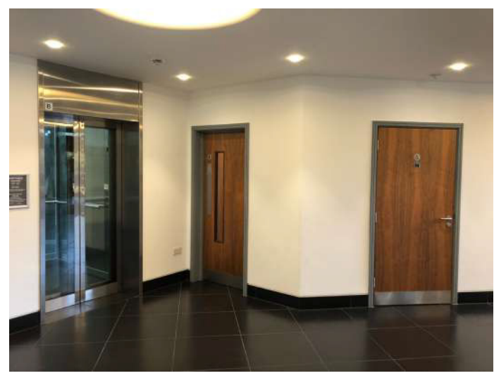
CRS Reception is on the 2nd floor, please use the inter-comm to advise the Reception Team if you require assistance to enter the reception area.